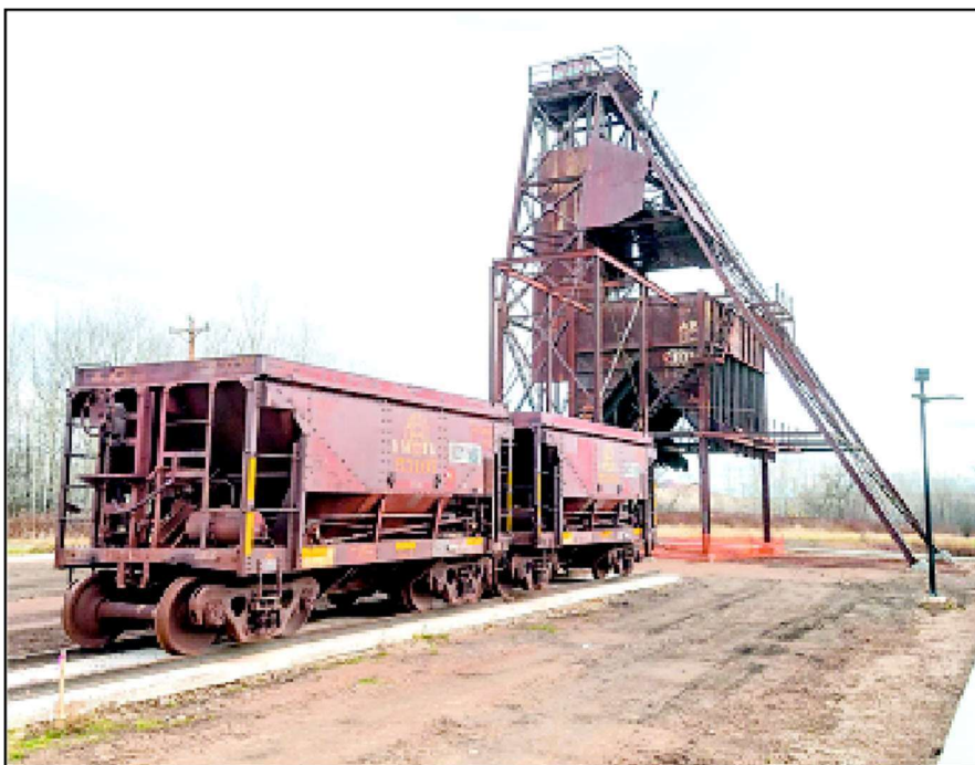
Bruce Headframe – Chisholm, MN