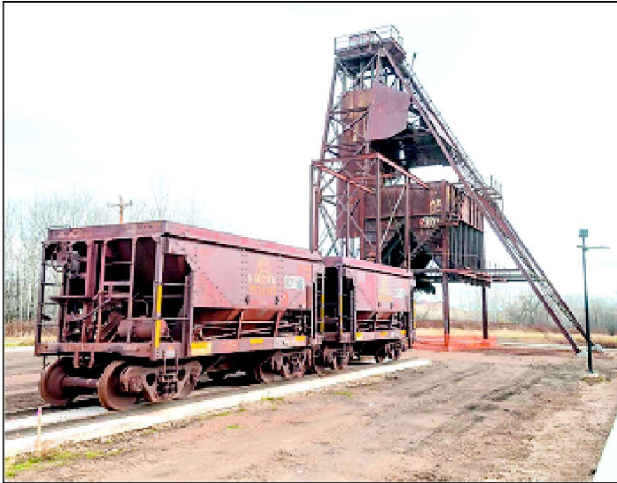
Bruce Headframe – Chisholm, MN